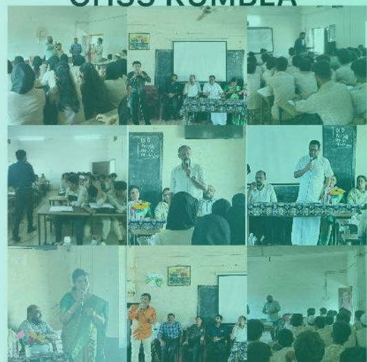
CAPACITY DEVELOPMENT PROGRAMME